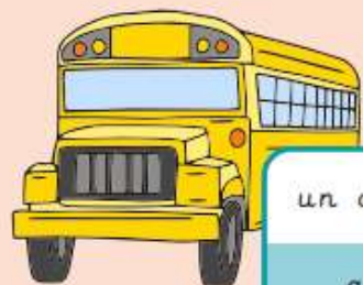
un autobus a bus