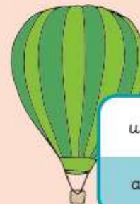
un ballon a balloon