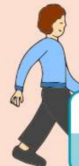
à pied on foot