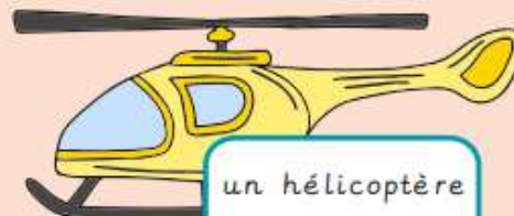
un hélicoptère a helicopter