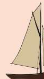
un bateau a boat