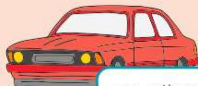
une voiture a car