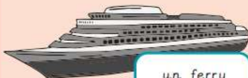
un ferry a ferry