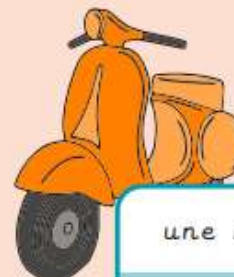
une moto a motorbike