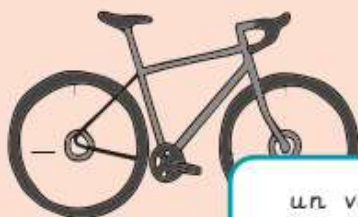
un vélo a bicycle